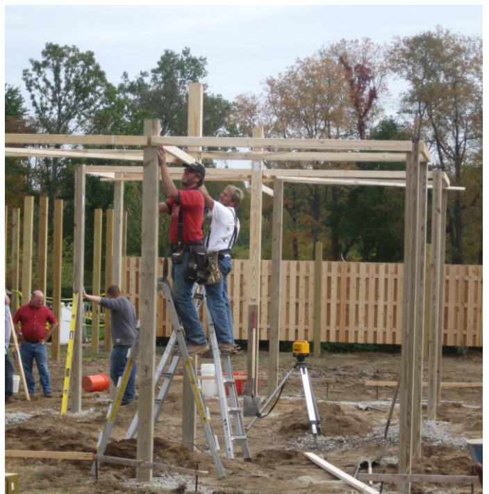
Workers assemble the frame of the studio in the bonsai garden. 10-2-12