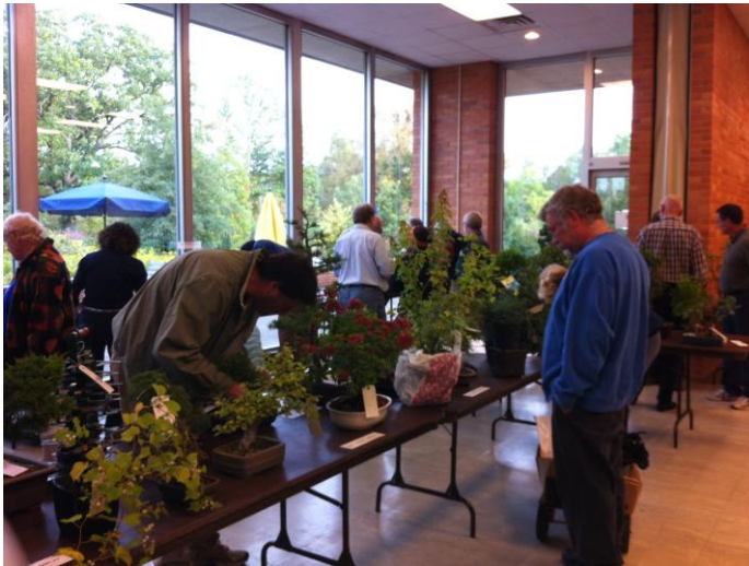
Some of the visitors bidding in the silent auction.