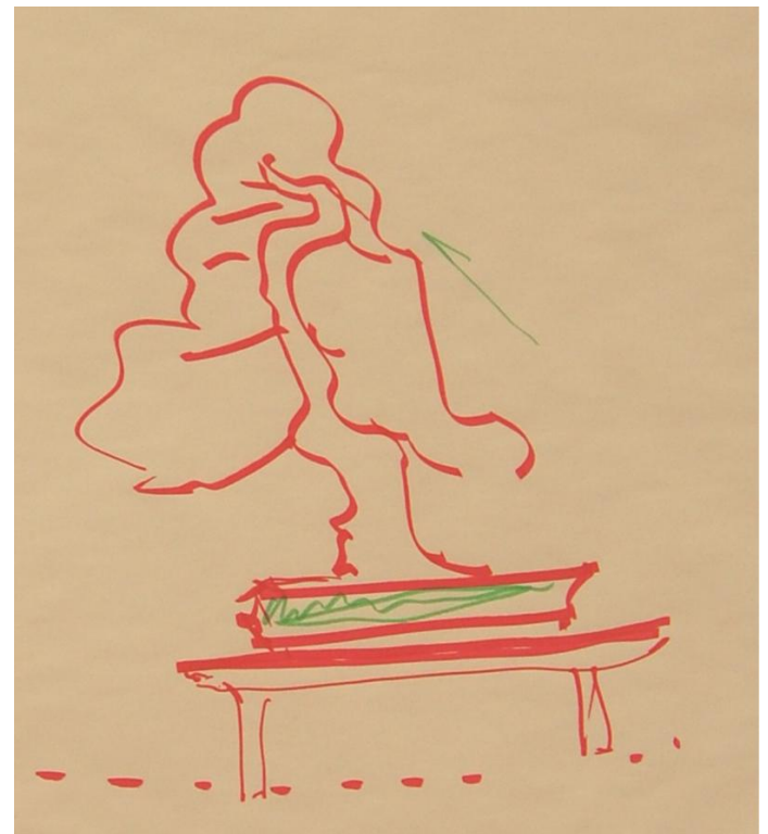
Drawing by Lindsay Shiba at AABS Meeting (June 2011)