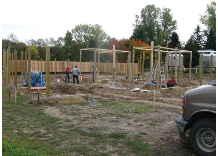
The Bonsai and Penjing Garden takes shape. Construction continues with the framing of the structure within the garden. 10-2-12