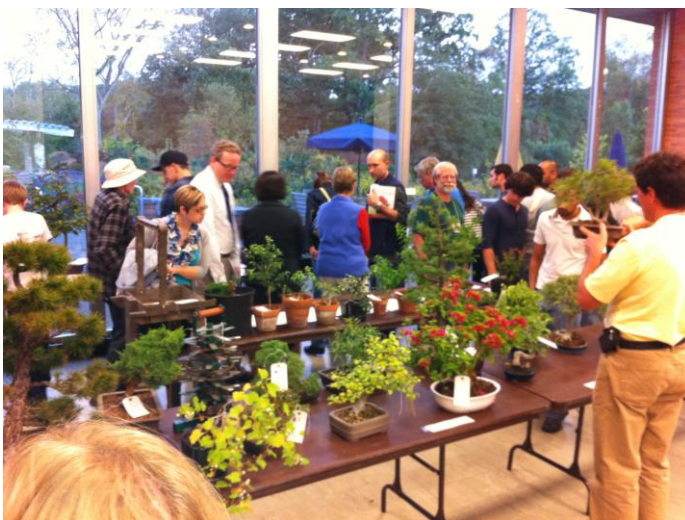
Visitors and bonsais in display for the live auction.